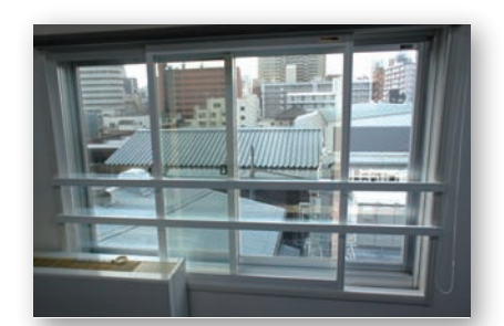
Double-pane windows at the Head Office