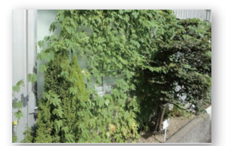
Plant shield at Kawachi Plant