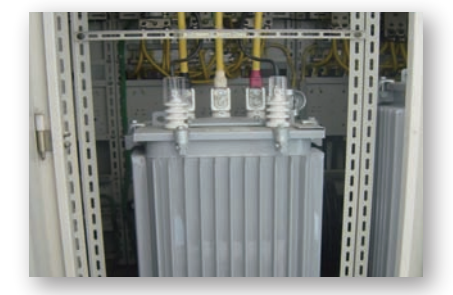
High efficiency transformer at the Mie plant