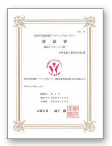
"Leading Company for the Empowerment of Women" certificate