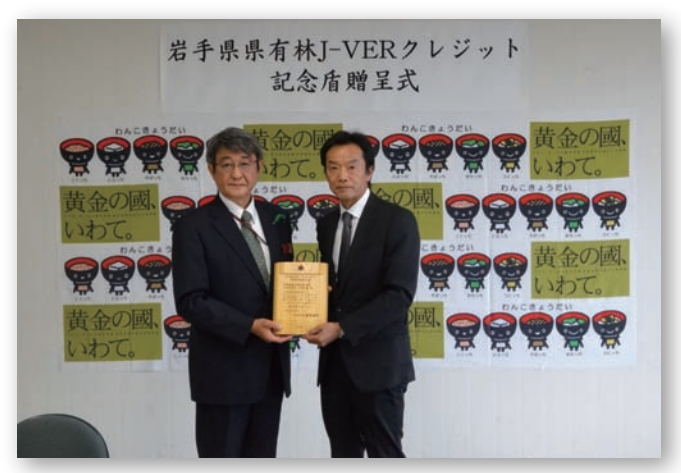
Memorial plaque presentation ceremony

By purchasing J-Ver credits, NKC was able to offset a portion of the CO2 emissions generated by lifters made by Kolec and garbage disposers sold by the EPD Room. Offsets amounted to 34t-CO2 for the lifters and 40t-CO2 for the garbage disposers.